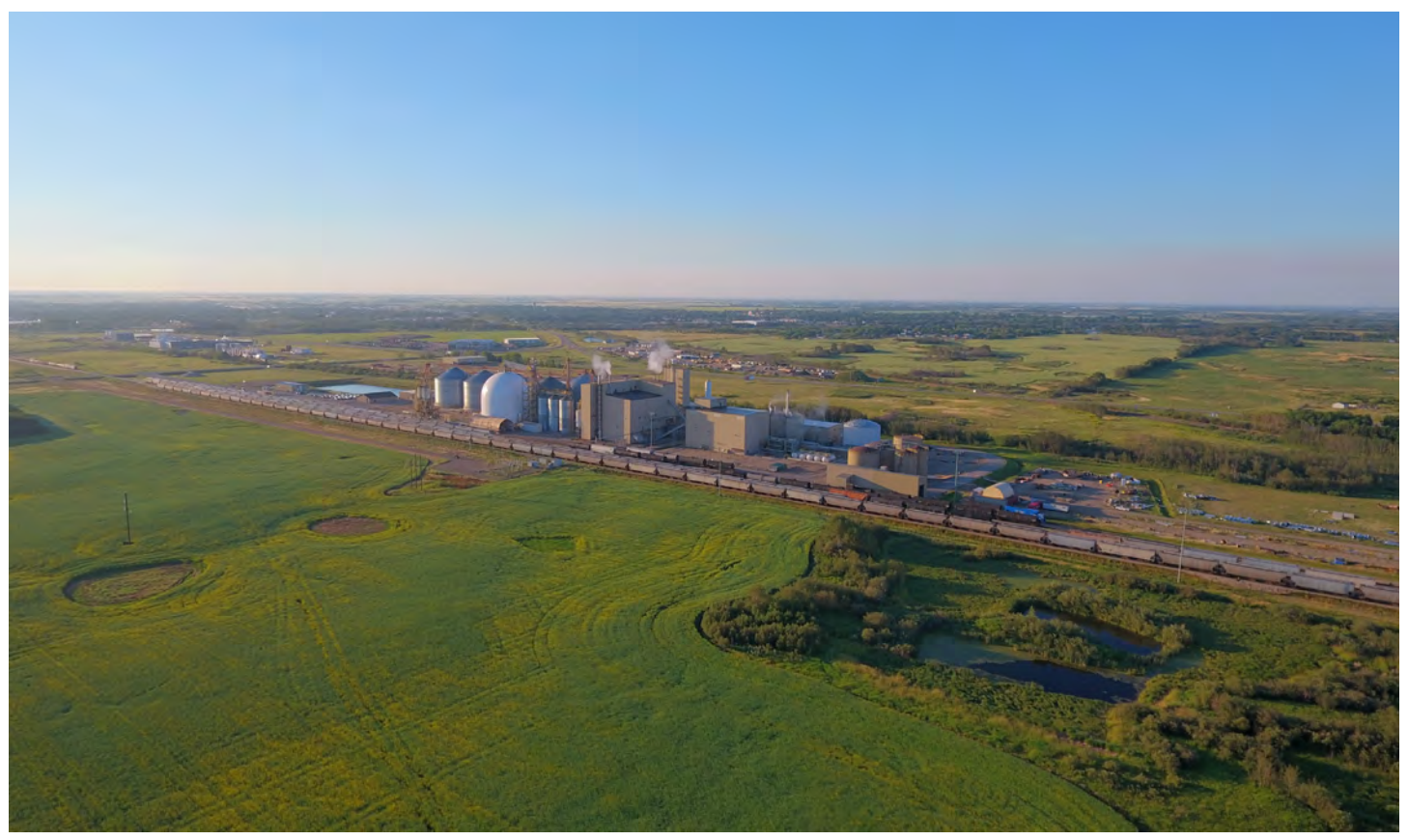
LDC canola crushing facility, Yorkton, Saskatchewan